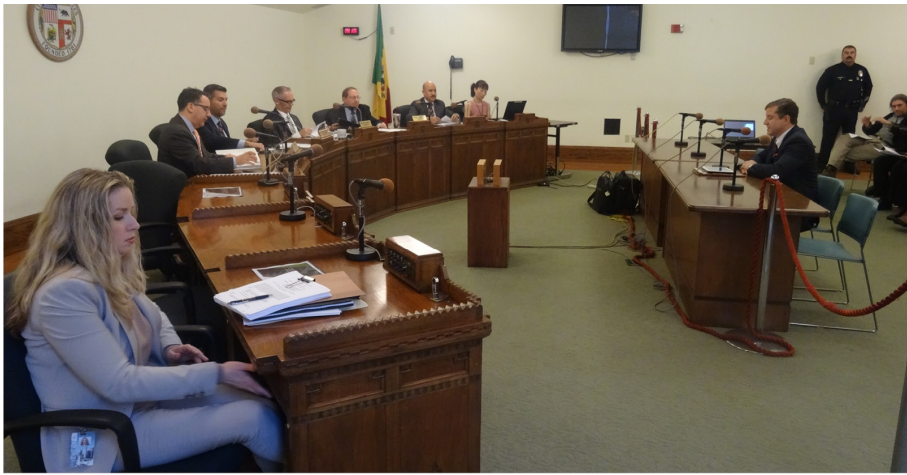
Speaking to the Council Energy and Environment Committee about our Industrial, Economic and Administrative Survey of the Dept. of Water and Power.